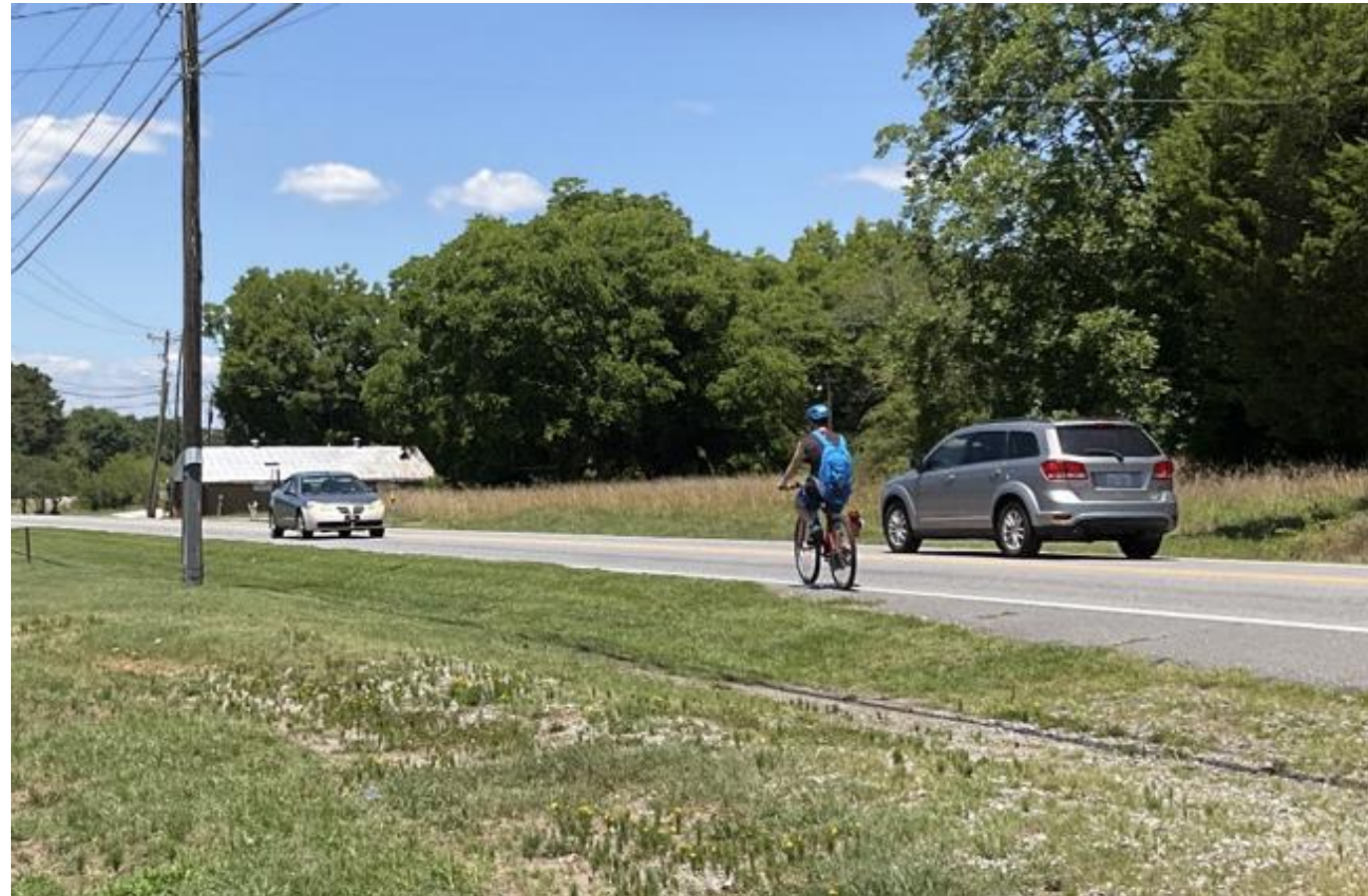
Main Street, Ellenboro, NC

https://frcnc.gov/regional-development/isothermal-rural-planning-organization-rpo/fonta-flora-feasibility-study/ellenboro-rail-trail-feasibility/