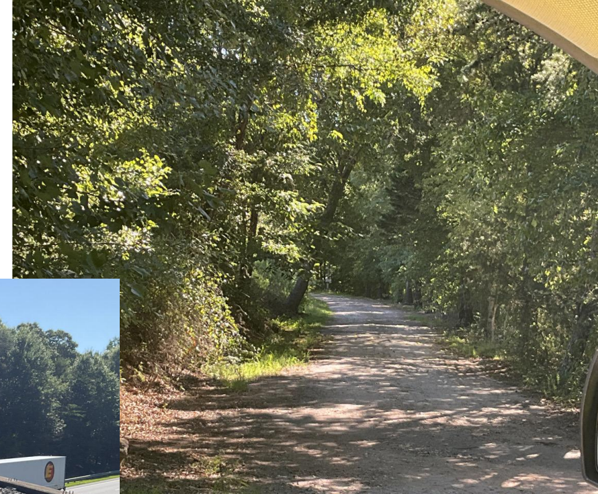
Existing Corridor