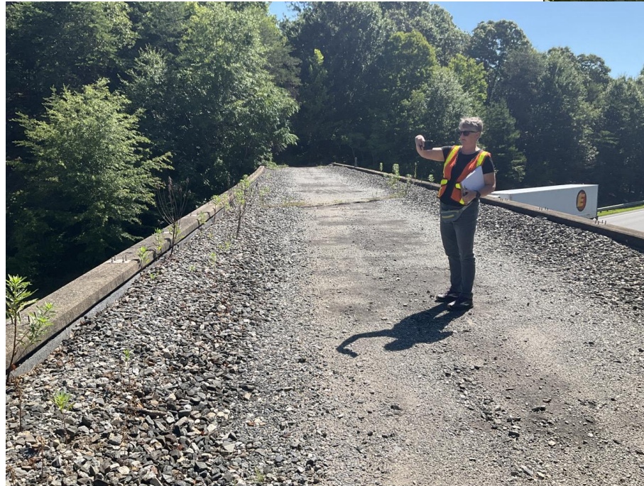
Rail Bridge over HWY 74