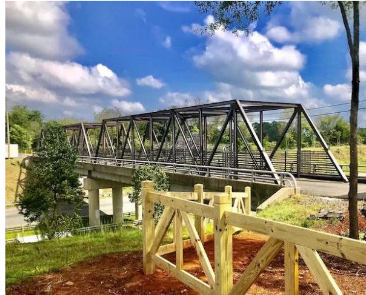
Thermal Belt Rail Trail near Forest Hunt Elementary School