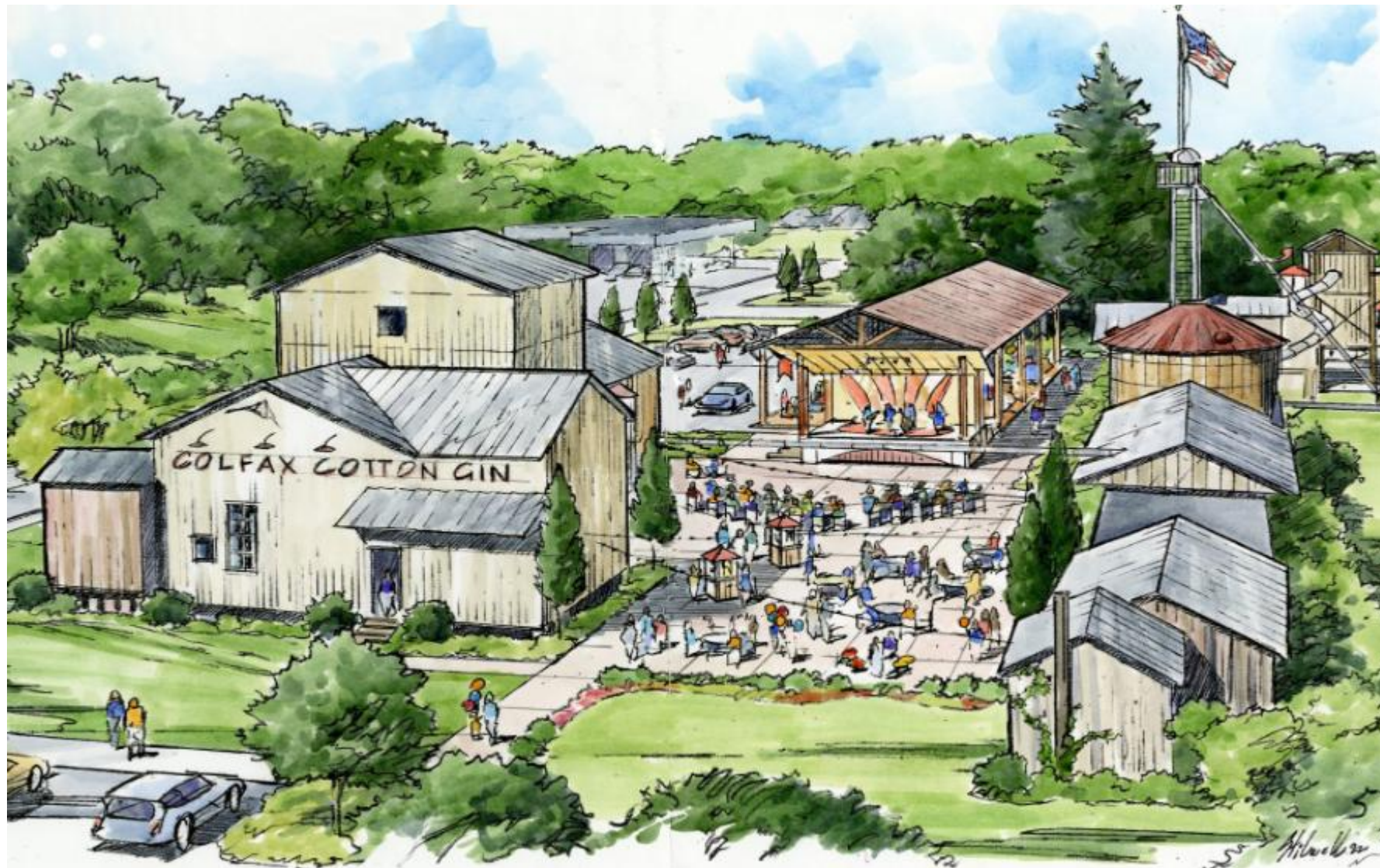
Rendering of Colfax Park in Ellenboro