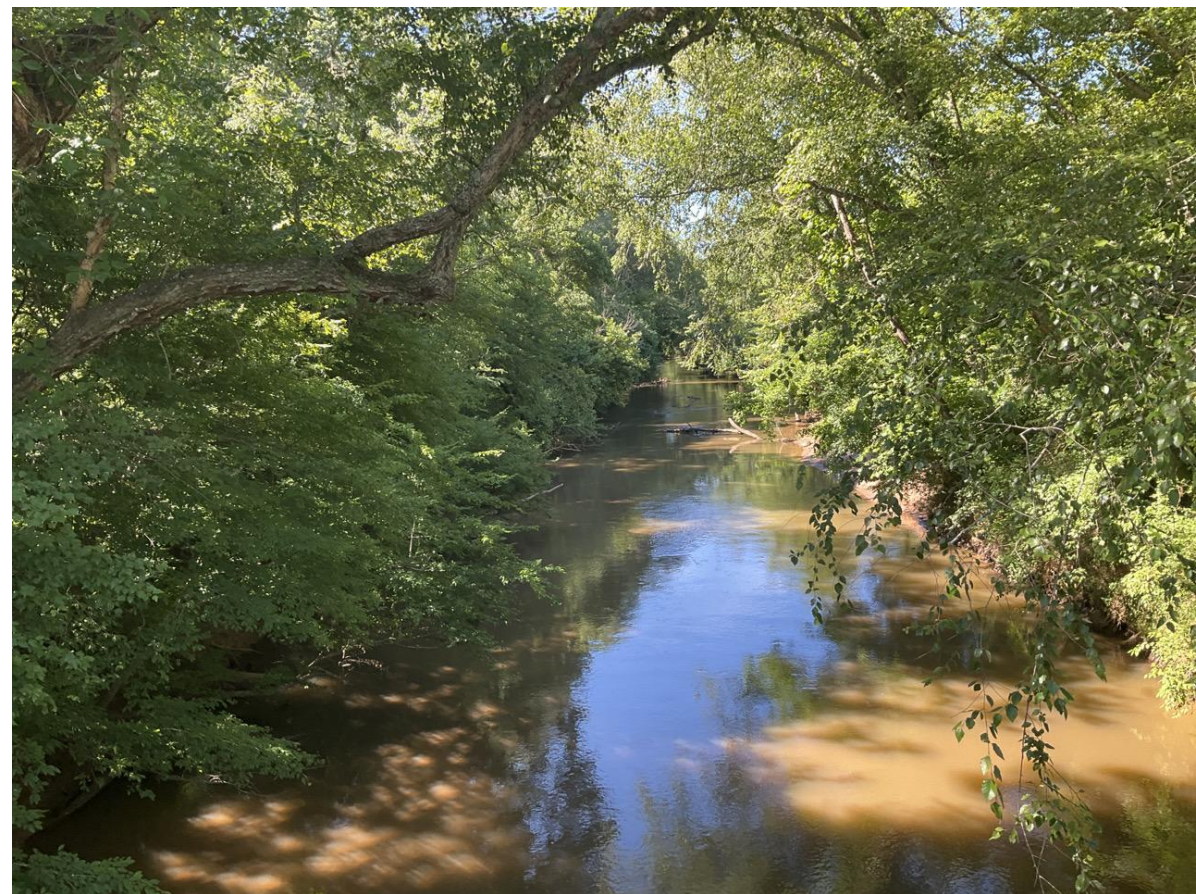
Second Broad River, Rutherford County, NC