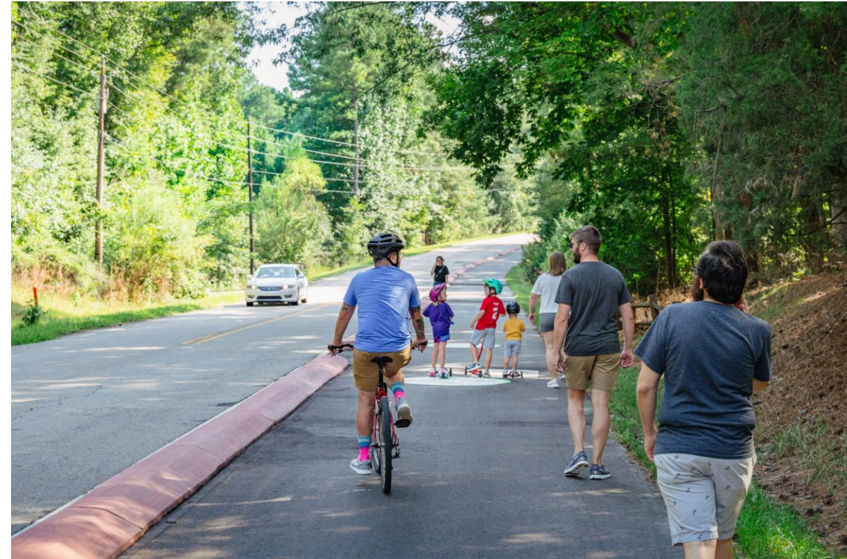
Side Path