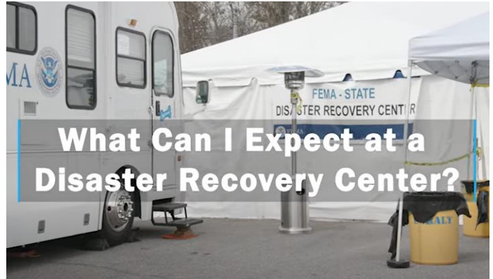
FEMA Video: Assistance Available at a FEMA Disaster Recovery Center for Survivors in North Carolina